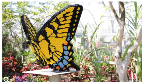
Image 2: Sean Kenney's Lego sculpture of a tiger swallowtail butterfly on display at the Naples Botanical Garden in Naples, Florida.