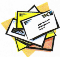
Letter to a Loved One