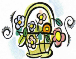
Basket of Questions